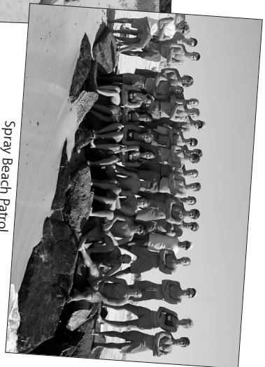
Spray Beach Patrol