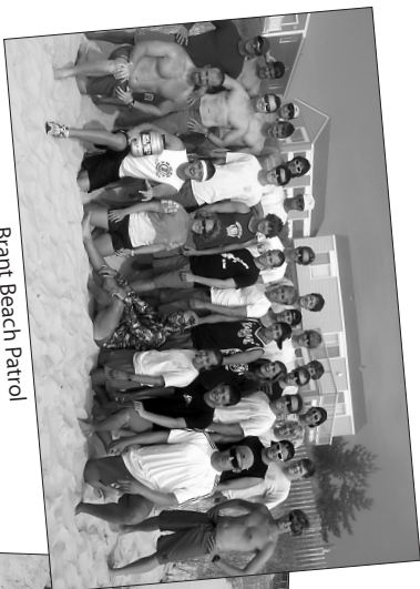
Brant Beach Patrol