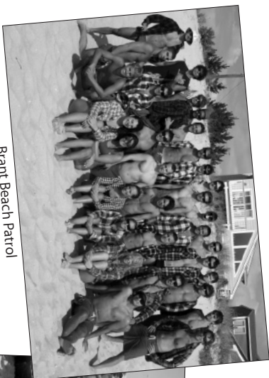
Brant Beach Patrol