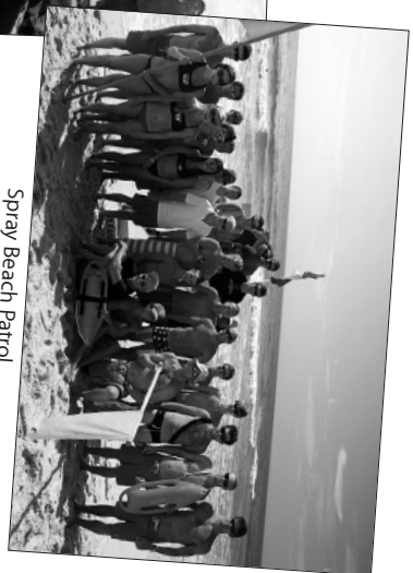
Spray Beach Patrol