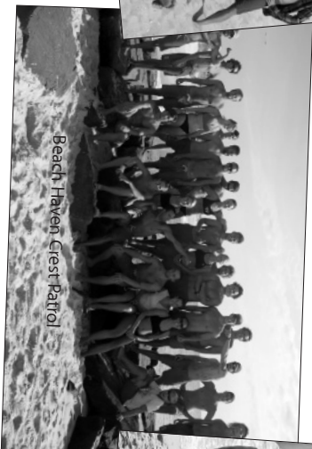
Beach Haven Crest Patrol