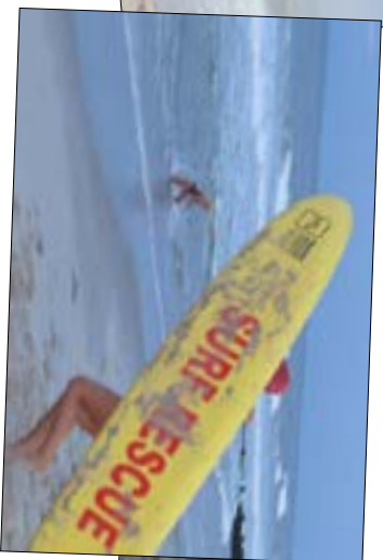
31st Annual Mayor's Cup Loveladies/North Beach