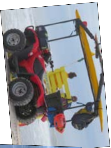
1000-meter Swim Beach Haven Crest